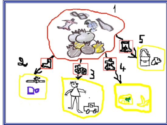
Fig 2. : Classification of rubbish: map of group