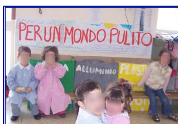
Fig. 1. pupils sat next to the carton boxes for recycling painted by them

Analysing the conversation, teachers realized children didn't know anything about rubbish collection and recycling process. So, they built together containers for recycling waste using carton boxes and painted them with different colours (fig. 3). At the same time the concept of materials was introduced through games and sensorial experiences and children produced conceptual maps (fig. 4). To evaluate this first step, children worked on a group map on differentiated waste disposal (fig.5)