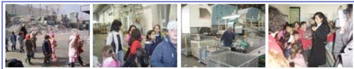
Fig. 7 Visit a plastic recycling factory

At this point, pupils had to understand the concept of recycling. So they went to visit a recycling factory (fig. 7); took part with their parents in a creative laboratory using recycled materials (fig. 8); prepared with local environmental associations the containers to fertilize the vegetable garden (fig 9).