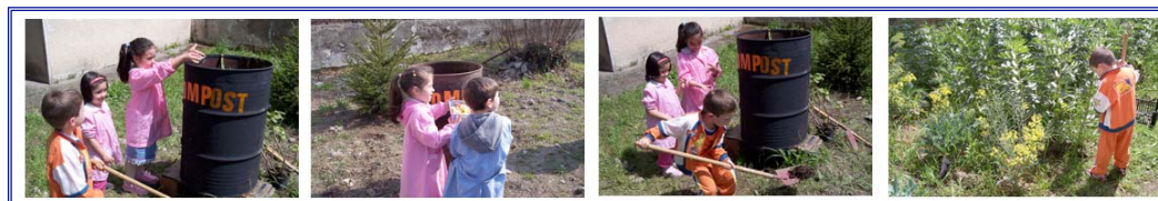
Fig. 9 Black bin for organic waste that become compost to fertilize our vegetable garden