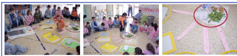
Fig. 5: Concept map of group on differentiated waste disposal

On that occasion, teachers gave to children 4 yellow circles representing the concept of materials (plastic, paper, aluminium and organic), same arrows named with linking word "is made of.." and a red circle representing the general concept of waste. Older children put circles in the room: the big red circle at the top