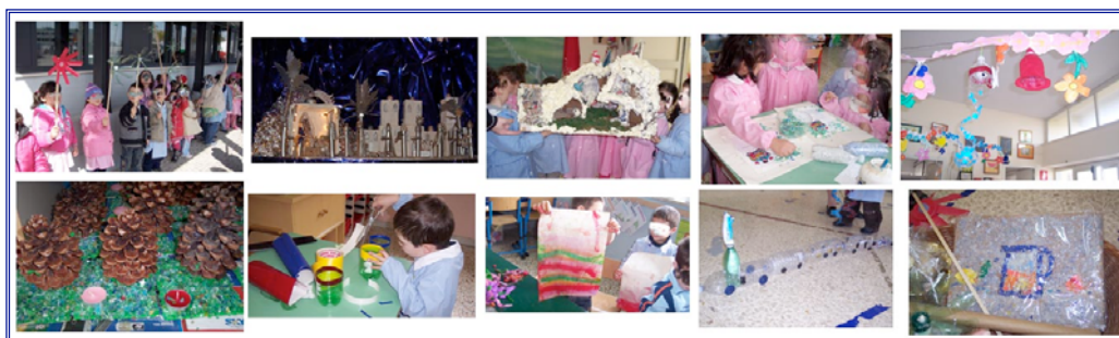
Fig. 8 Finding a creative way to use recycling waste: the laboratories