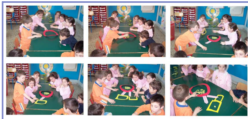
Fig.11 The cooperative groups working on concept maps