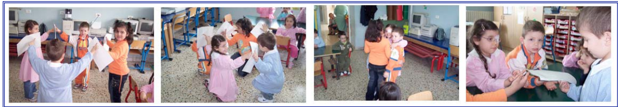
Fig. 10 Games of social interaction