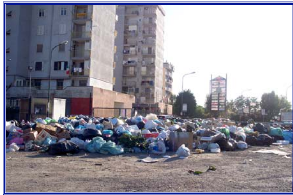
Fig. 1 The big problem in the city: the rubbish

After the conversation, children and teacher set a legend and worked on the first group map where rubbish were considered broken, useless, rotten or old objects (fig. 2).