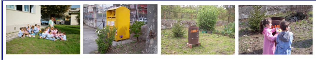
Fig. 6 Bins of different colours for separate rubbish collection

and the yellow ones at the bottom linked by the arrows. Then, in turn, each child put one object from the red circle to a yellow one. Children were very active during the game participating with comments and advices. For these reasons, when the local authority put the recycling containers in the school garden, children found very easy to use them. (fig. 6).