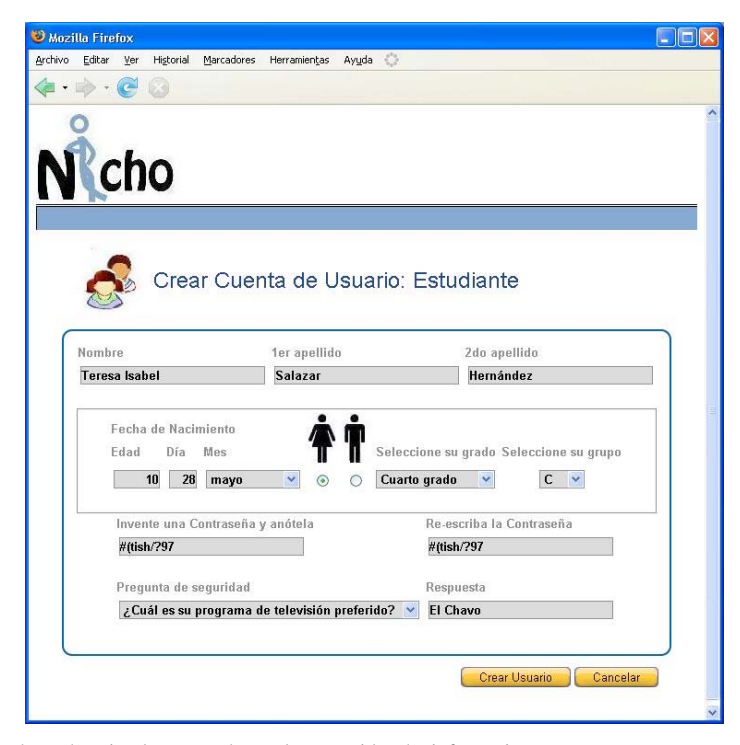
Figure 2. Through a simple screen the student provides the information necessary to create a userid.