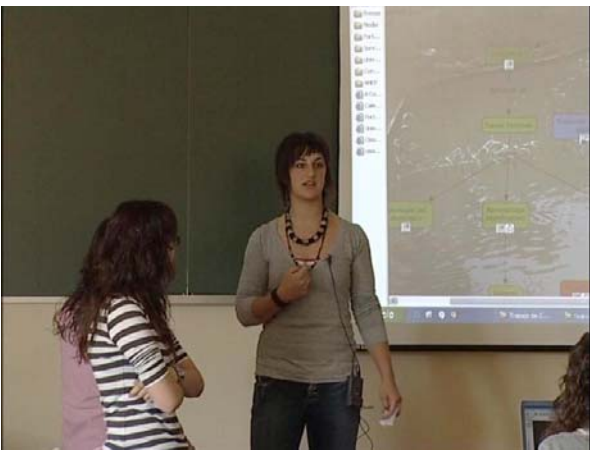
Figure 5 shows one of the groups during their presentation.

Each group presented its work to the others using ICT resources (computer and video projector), in 20- minute presentations.