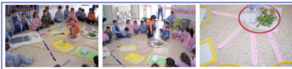
Fig. 5: Concept map of group on differentiated waste disposal

On that occasion, teachers gave to children 4 yellow circles representing the concept of materials (plastic, paper, aluminium and organic), same arrows named with linking word "is made of.." and a red circle representing the general concept of waste. Older children put circles in the room: the big red circle at the top