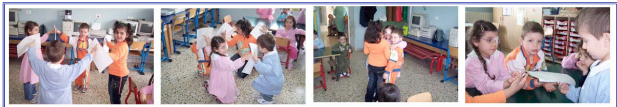
Fig. 10 Games of social interaction