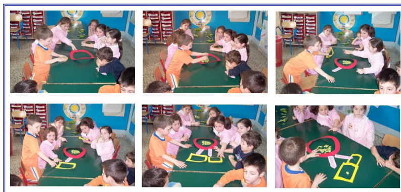
Fig.11 The cooperative groups working on concept maps