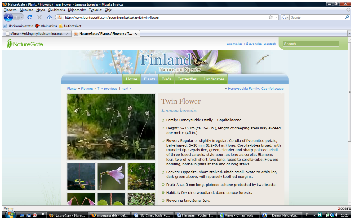
Figure 3. Twin Flower ( Linnaea borealis ) was found out of 400 species of Finnish wild flowers using only four interactive easy steps.

We are presenting the poster and demonstration the Third International Concept Mapping Conference (CMC2008), because we are looking for R&D and business partners all over the world. Eija and Jouko Lehmuskallio have the world wide patent for their unique, object and species identification software which is one of the core elements of NatureGate® online service. Selecting observable characteristic, interacting with the NatureGate® online service, you'll probably very quickly find the plant you are looking for from hundreds of wild flower images, e.g. using (1) color of flower 'red', (2) shape of corolla 'bell shaped', (3) shape of leaf is 'round' and (4) the height is under 10 cm. The result emerges: