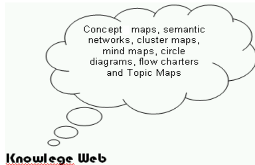
Figure 1. Thinking about concepts

Knowledge representation, semantics, ontologies, knowledge organization, metadata, XML, XTM, RDF, etc... Who have not heard to talk about these concepts once? How many times we have stopped thinking about them?, What is really their meaning?, How they are interrelated among them?, and what is more important: Are they really take place to any sort of innovation, or are we thinking about the same all the time?