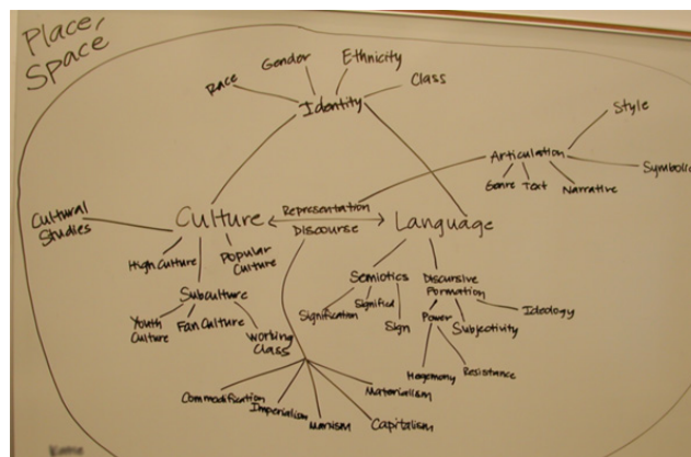
Figure 1: Student generated collaborative map of keywords on Culture

Our approach builds on an experience in a prior class we taught about Cultural Studies. As an introductory exercise we provided students with a list of keywords and the assignment to map those out on a whiteboard. This assignment was done collaboratively in groups of three and four. It was purposefully done at the beginning of the course under the assumption that students would not have much background on the keywords. We aimed to help them to approach the topic by generating questions, by provoking them to provide their reasoning behind the respective definitions and use the various map representations to generate a discussion around different views of the new research field.