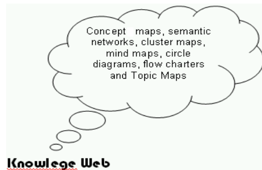
Figure 1. Thinking about concepts

Knowledge representation, semantics, ontologies, knowledge organization, metadata, XML, XTM, RDF, etc... Who have not heard to talk about these concepts once? How many times we have stopped thinking about them?, What is really their meaning?, How they are interrelated among them?, and what is more important: Are they really take place to any sort of innovation, or are we thinking about the same all the time?